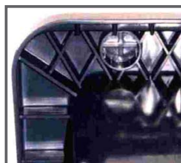
Deeper combs ensure optimum accommodation on the lifting device