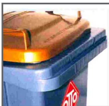
Lid with bow-type handle