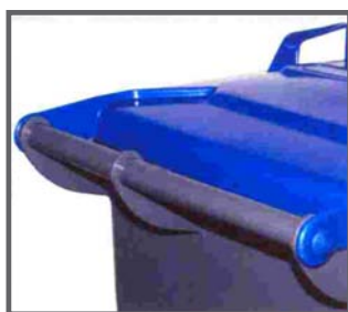
Handle bar, diameter 30mm